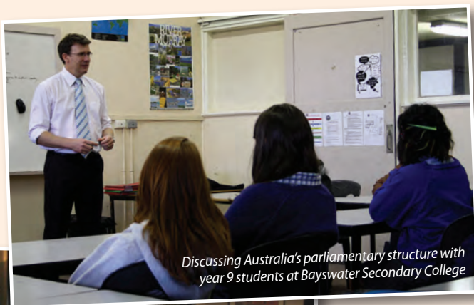
Discussing Australia's parliamentary structure with year 9 students at Bayswater Secondary College

I strongly believe in public service and have always been involved in community organisations, including the Red Cross, my local Lions, and local church. Over the last few years, I have helped found a new organisation ('Teach for Australia') that encourages young people into teaching in disadvantaged schools.