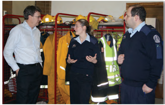
Discussing priorities and plans with the Bayswater CFA Captain and First Lieutenant.

Bayswater CFA is one of several local volunteer CFA brigades who do an exceptional job in protecting our community.