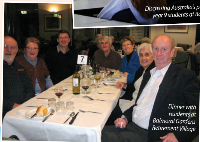
Dinner with residents at Balmoral Gardens Retirement Village